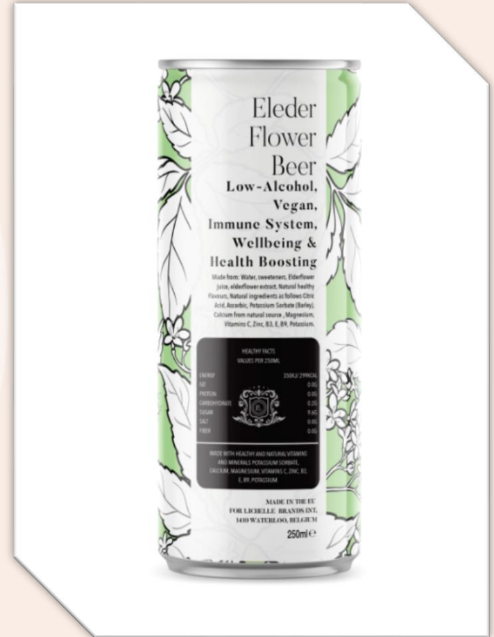
Non-compliant packaging example

* This is the name that DLC gives its quick first review