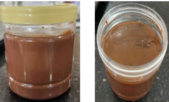
2% LMG- Oil Separation observed