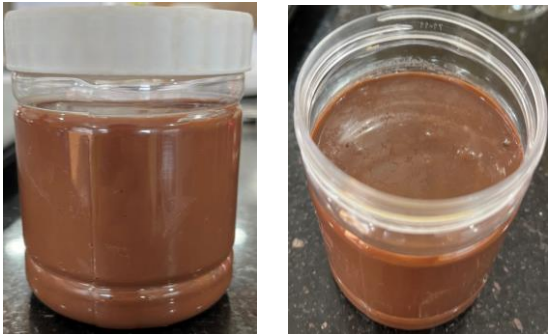
2.5% LMG- No Oil Separation observed