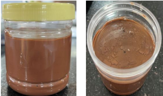
1% LMG- Oil Separation seen Large amount of oil Separation observed