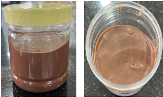
3% LMG- No Oil Separation observed