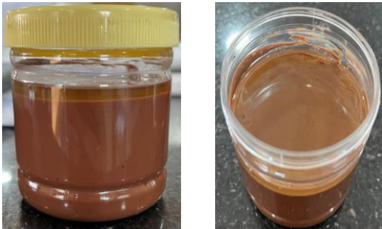
STD(Control)- Large amount of oil Separation observed