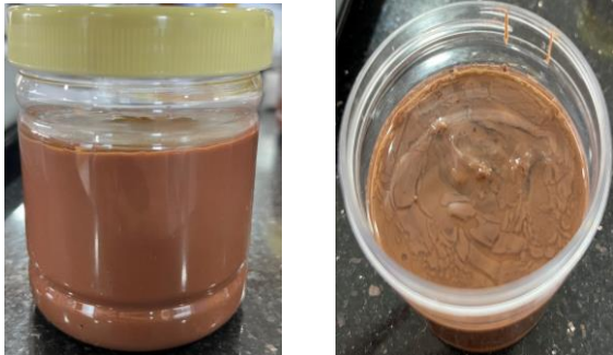
1.5% LMG- Oil Separation seen Large amount of oil Separation observed